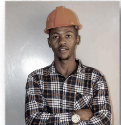
Costa Manesa General Manager